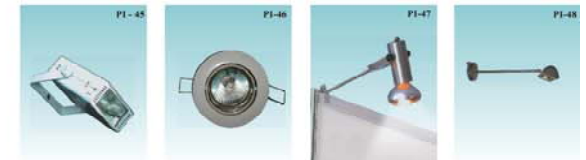
Metal Halide Ceiling Down Light Spotlight Long Arm Halogen Light