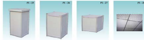
Podium 50cm(L) x 50cm(W) x 100cm(H) Podium 50cm(L) x 50cm(W) x 70cm(H) Podium 50cm(L) x 50cm(W) x 50cm(H) Grid Ceiling 100cm x 100cm