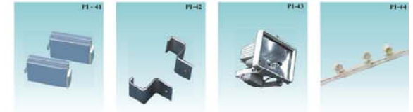
Graphic Retainer Photo Clip Halogen Lamp Track Light