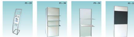
Brochure Rack Glass Shelf Set of Three Wooden Shelf Flat/Adjustable Pin-Up Board with Grey Fabric