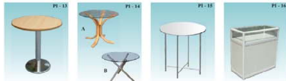
Round Table 70cm(Dia) x 75cm(H) Round Table (Wooden/Cross leg) 90cm(Dia) x 75cm(H) Round Table 80cm (Dia) x 75 (H) Glass Counter 100cm(L)x50cm(W)x100cm(H)