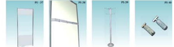
Glass Wall Wall Coat Hanger Coat Hanger Self Standing T-Bolts