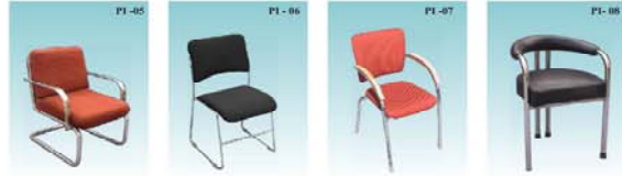
Sofa Seat - Single Visitor Chair Sofa Chair Conference Chair