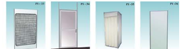
Wire Mesh with Hooks Lockable door System Folding Door System Panel