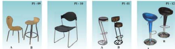
Wooden Chair & High Stool Fibre Chair Bar Stool (High) 75cm (H) Bar Stool (Adjustable) 50cm (H)