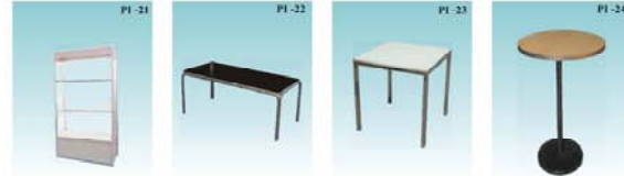
Showcase 51cm(L) x 100cm(W) x 200cm(H) Centre Table 120cm (L) x 45cm (W) Square Table 70cm(L) x 70cm(W) x 70cm(H) Standing Discussion Table