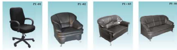
Executive Chair VIP Sofa Single VIP Sofa Double VIP Sofa Three Seater