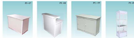
Table 115cm(L)x60cm(W)x70cm(H) Two Level Information Counter 100cm(L)x60cm(W)x110cm&75cm(H) Side Rack 40cm(L) x 100cm(W) x 60cm(H) Showcase 50cm(L) x 50cm(W) x 200cm(H)